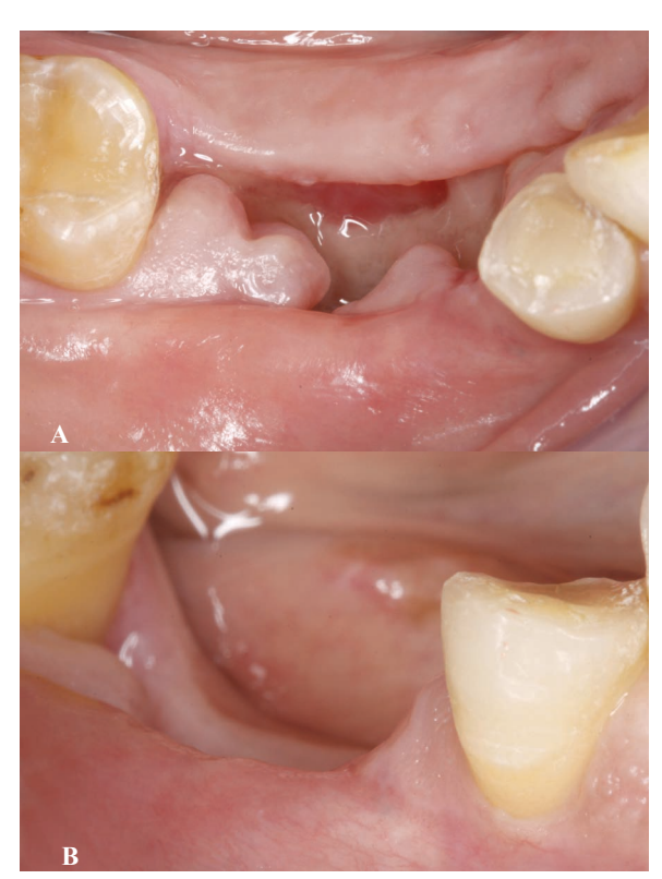
Figure 4. Appearance of the tissue after 2 weeks. We can see that there is tissue at the bottom of the defect.