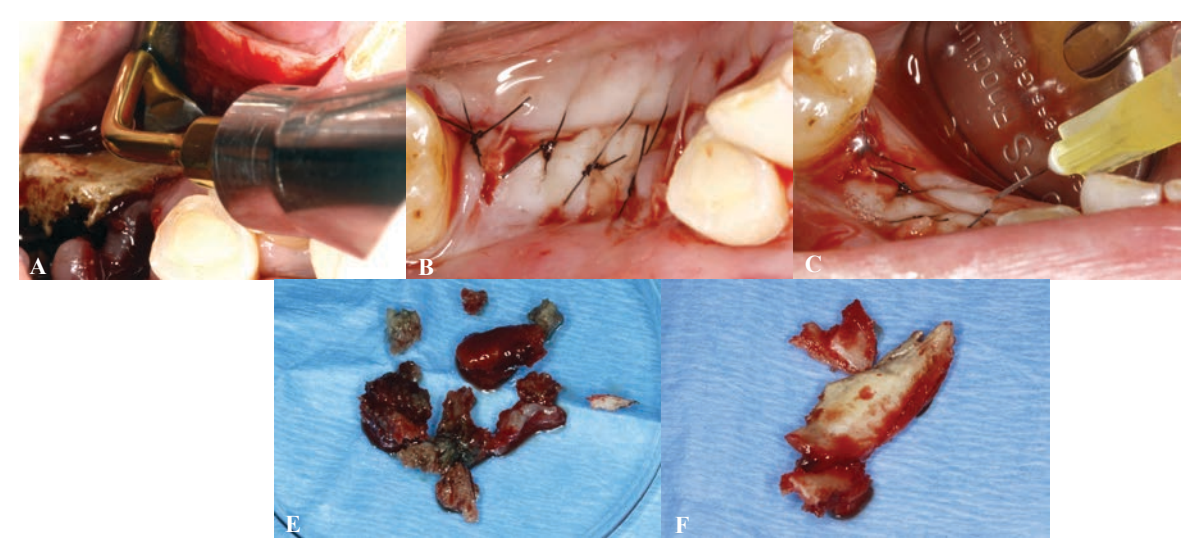
Figure 2. (A) Excision of necrotic bone with ultrasound surgery. (B) Primary closure of the surgical wound after the placement of Endoret (PRGF). (C) After this the incision margins were infiltrated with Endoret (PRGF) liquid (fraction 2 recently activated). (D) Soft tissue fragments that surrounded the bone sequestrum. (E) Bone fragments of necrotic tissue after the excision.

The bone fragments, once excised, were referred for the histopathological report and to confirm the presence of bisphosphonate-related osteonecrosis of the jaw (BRONJ). The patient was then followed up once a week.