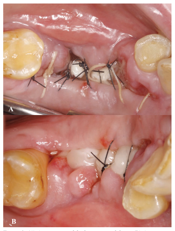
Figure 3. (A) Appearance of the lesion a week later. (B) Appearance once the suture has been removed and Endoret (PRGF) added again.